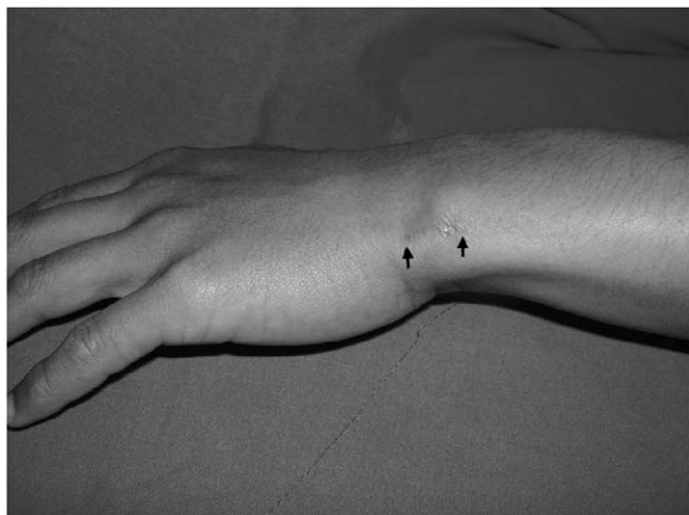
Fig 1 The surgical scar (black arrow) on the ulnar border of the left wrist extending distally from the ulnar styloid at the site of the 6-U portal.